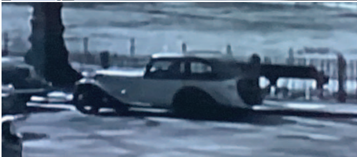
Chris's Speed 20 at the top from an old photo with 2 images from the film shown below - apologies for the picture quality!

I think it is actually an SA series not the SB as mine is. But of course I could be mistaken - as you can imagine a photograph of my television screen is not overflowing with pixels! However, by the next day Dave had discovered the film is a retitled remake of an earlier film for the American market, made in 1933 which, of course, is bang on for the SA 20. Just around the corner, of course, in Berkeley Street, was Charles Follett's showroom where without doubt the car had been sold from. Not only that but Dave has narrowed the search down to only three possibles that were two tone painted. That is probably as far as we can go right now but this snippet joins the others at the Trust and eventually may well be a jigsaw piece to add to a car's history.